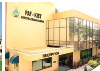
North Nazimabad Campus